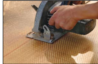
Unlike shelters that rely on concrete and steel, the wall sheathing of the Norplex-Micarta StormBlocker™ composite-based system is relatively thin and easy to cut.

A composite-based storm shelter consists of a reinforced wood framing system covered with high strength thermoset composite material on the outside (walls and ceiling) and 3/4" plywood on the inside.