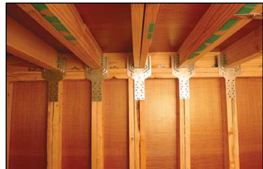
Located inside a house, the StormBlocker™ shelter is a small room specially constructed to provide a safe haven during wind storms that can severely damage or even destroy the rest of the house.

A shelter option that provides greater size flexibility than cinder block or ICF is a system consisting of wood framing covered with a steel outer layer and a plywood inner layer. Like thermoset composite material, steel can be cut to the exact dimensions required by the floor plan of a house. But the cutting is usually done off-site by a steel fabricator. Then, back at the building site, the steel is attached to the framing system. This could require screw holes to be drilled through the steel, or workers could be supplied with powder-actuated nailer guns to drive nails through the steel, a process that can be both expensive and time-consuming. By contrast, thermoset composite wall material is easily cut to the desired shape and nailed or screwed to the framing system. The entire job can be done at the building site by workers using standard construction equipment.