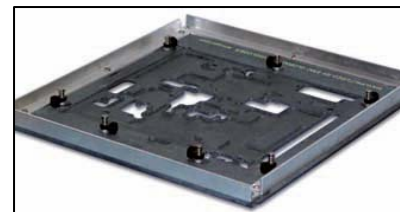
Lead-free solder pallet

WaveMax 6000 has enough flexural strength to keep pallets flat through thousands of extreme thermal cycles. The key is in its special epoxy resin, which features improved chemical resistance to molten solder. There are many different solder formulations, each of which causes a different reaction when it comes in contact with the resin in a composite pallet